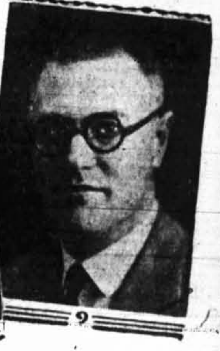
IMPORTANT FIGURES AT CEREMONIES.